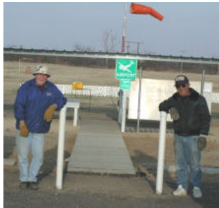
Hard workers seen at the field!!

Something else that will be "new" this year is the availability of the frequency